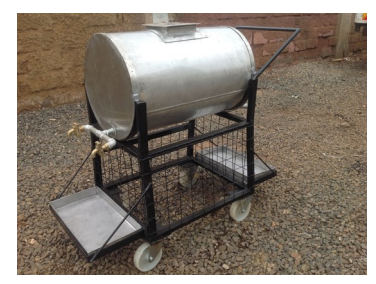
Institutional tea Urn for serving crowds