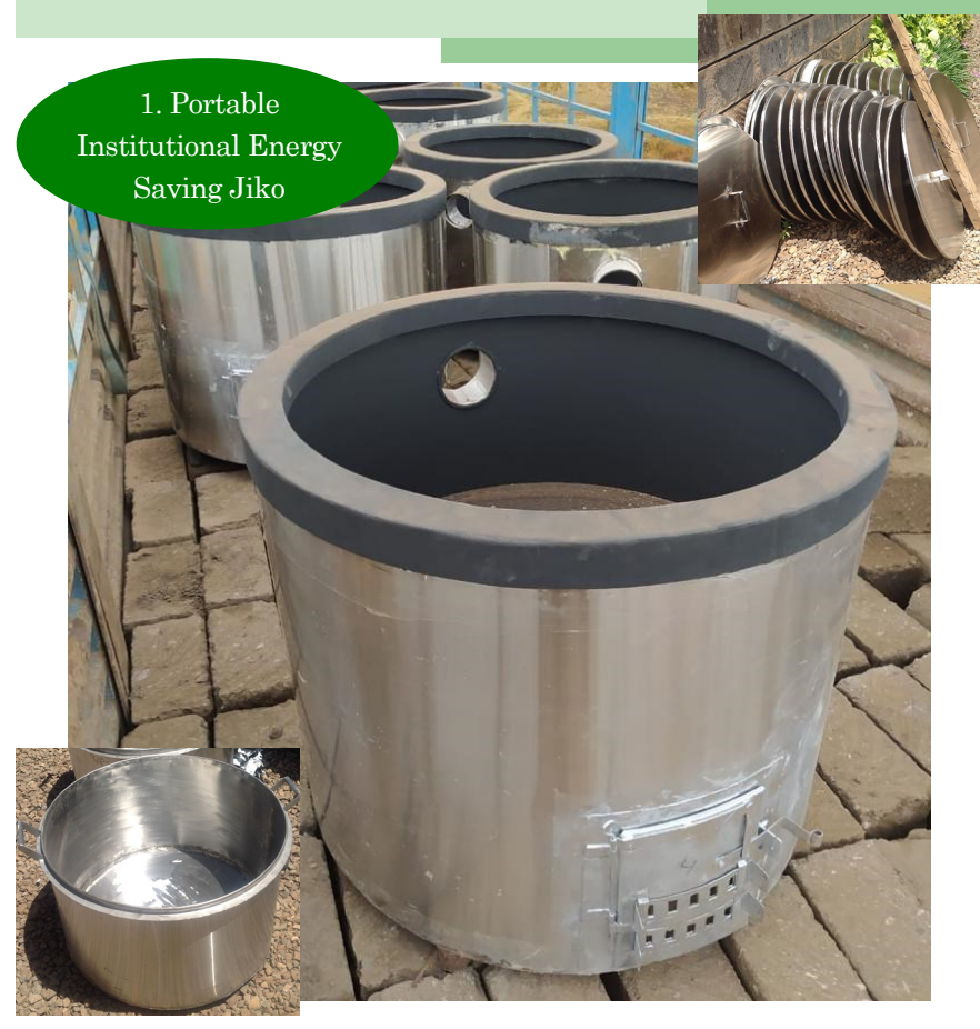
Popularly Known as the SMP Jiko