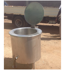
Gas Jiko Institutional