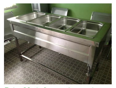
Baine Marie for catering services